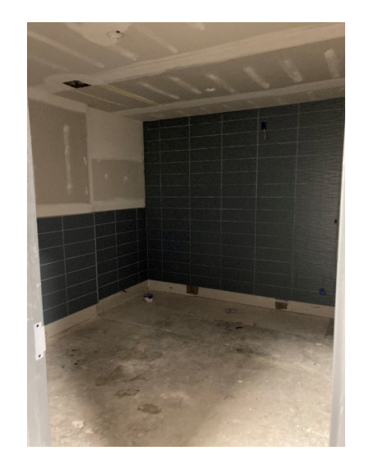
Tile work in the men's restroom, which has also been expanded.