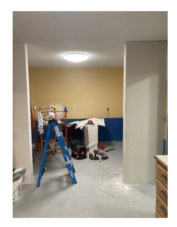
New copy, mail, work center created from area in breakroom/kitchen.